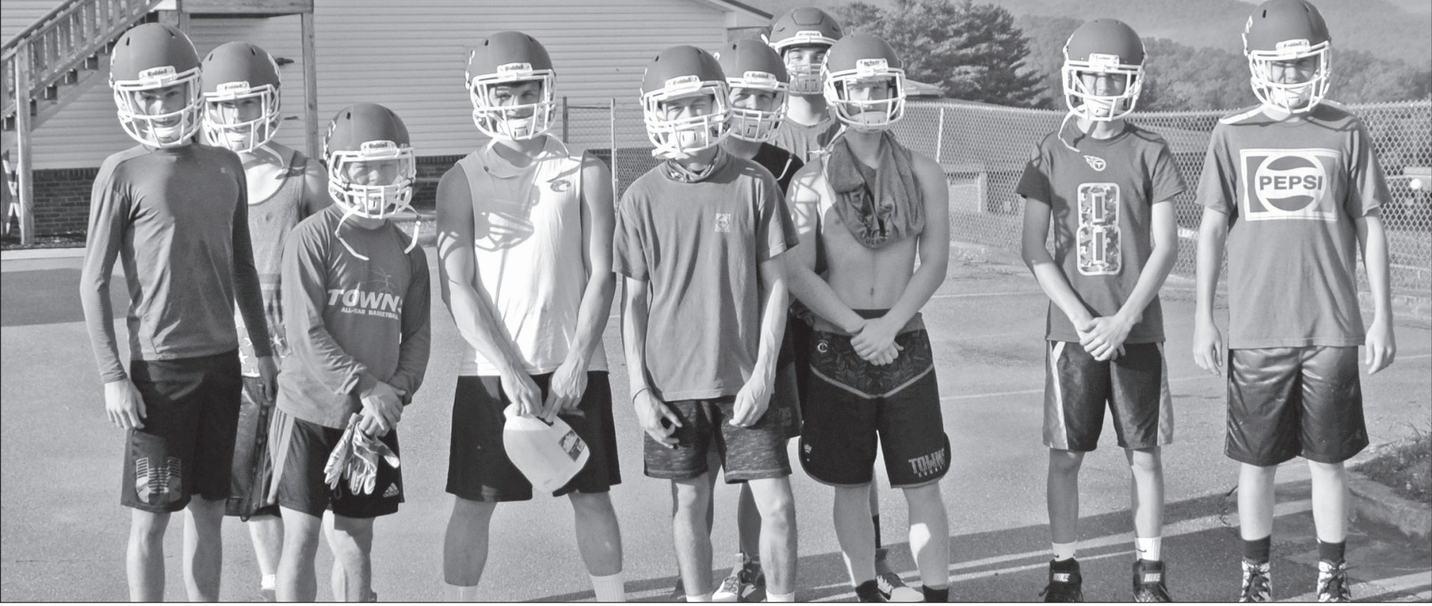
Indians football has been busy preparing for the upcoming season in recent weeks. However, The GHSA's mandatory dead period begins on June 26 until July 7 when no teams can workout.